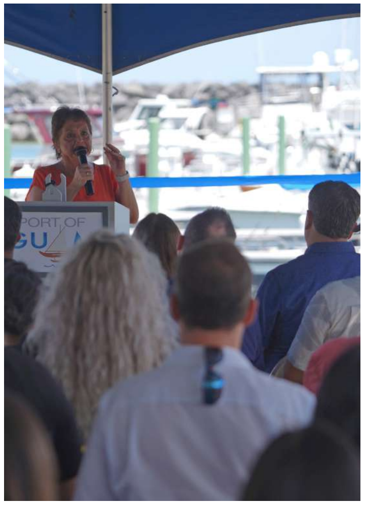
Story continues on pg. 6

The newly built restroom facility provides the