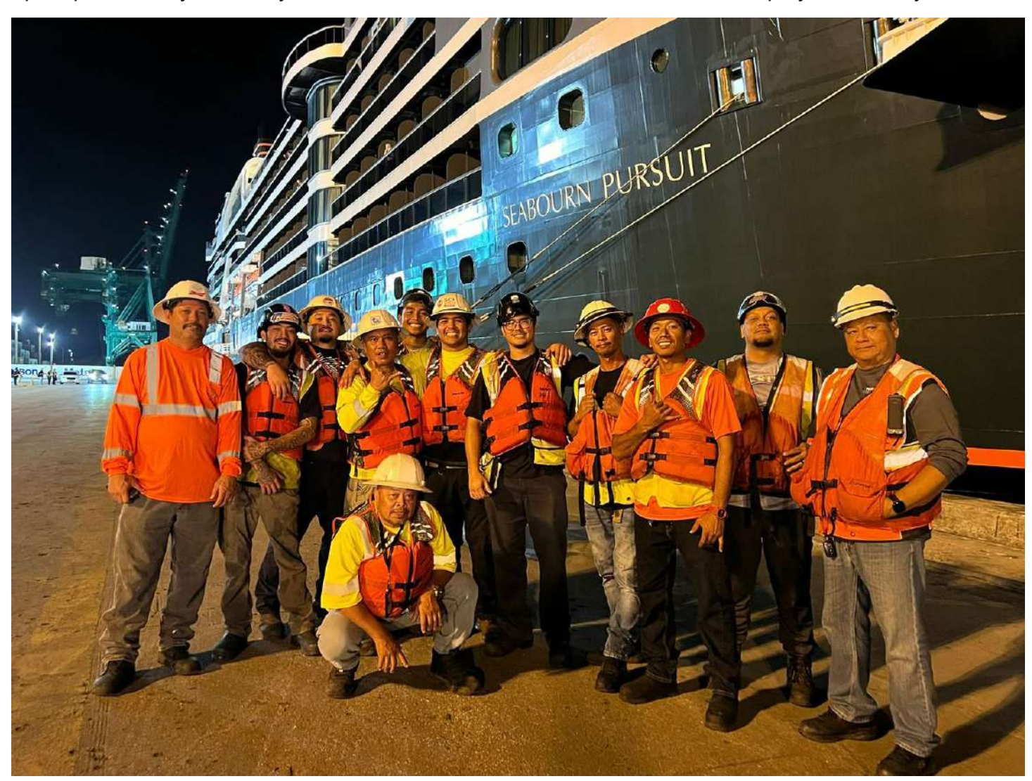
Stevedores gather for a photo after securing Guam's 8th passenger vessel of the year, the MV Seabourn Pursuit. The MV Seabourn Pursuit docked at the Port Authority of Guam at 9:30 p.m. on May 14, 2024 bringing 231 passengers and 240 crew members.