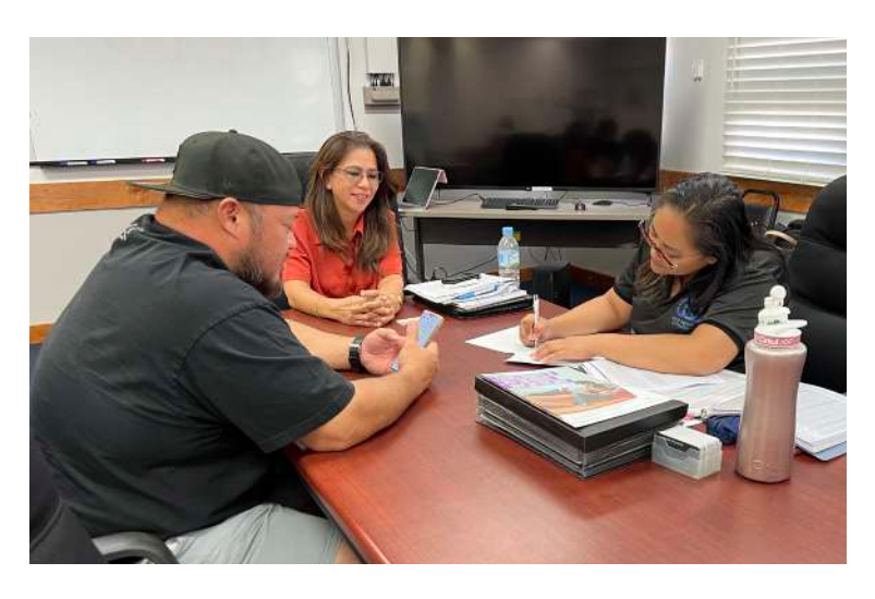
Transamerica Life Insurance representatives visit the Port to enroll interested employees on May 17, 2024.