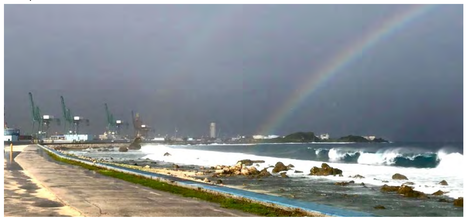
Story continues page 7