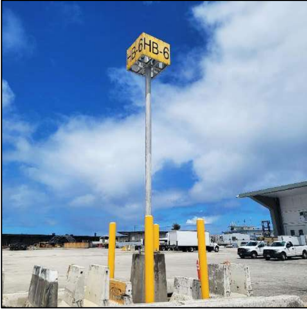
FIGURE 1: Existing Signage Pole to be removed.