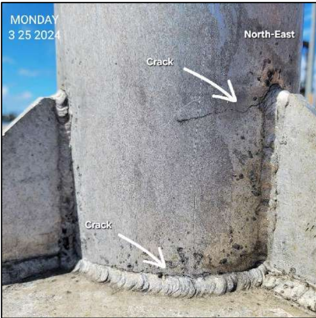
FIGURE 3: Example of Cracks at the base of the existing needs to be repaired.