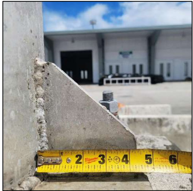
FIGURE 6: Gusset Plate (4" L x 5" H x 7/16" W)