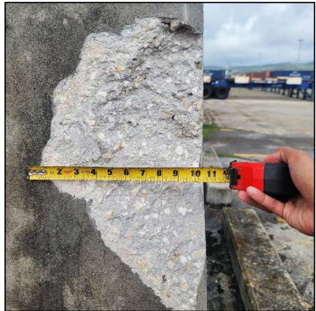
FIGURE 4: Example of the damage to the concrete base that signage pole.