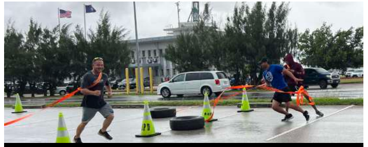
Tire Excercises by Stevedores