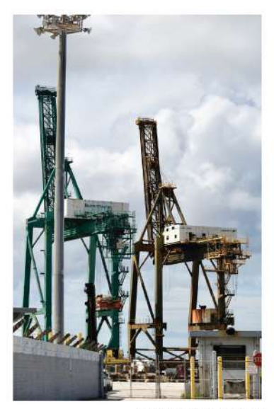
The Jose D. Leon Guerrero Commercial Port of Guam front gate on Oct. 16, 2023.

The port was established on Oct. 31, 1975 as a public corporation and autonomous instrumentality, naming it the Port Authority of Guam. On its 48th year, it has a total of 382 employees.