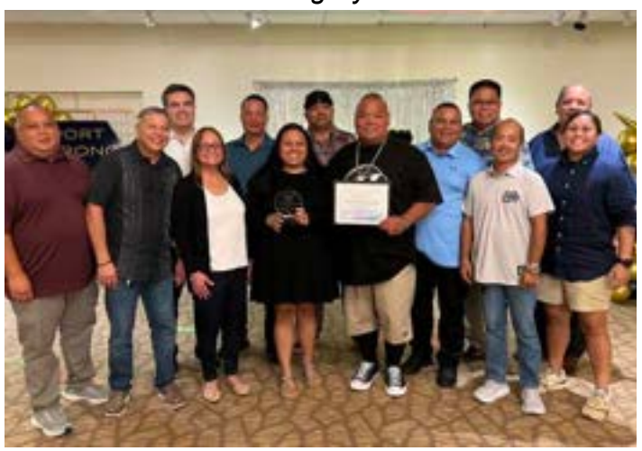
Good Housekeeping Work Center Corrosion Control Category II