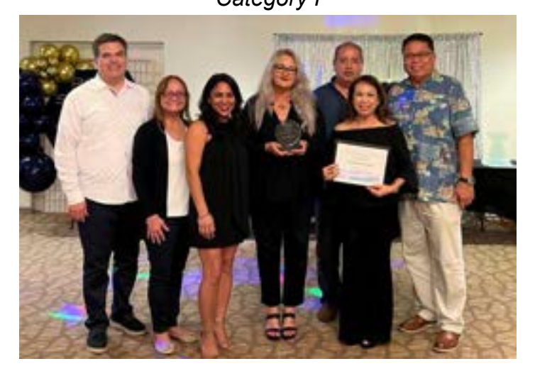
Good Housekeeping Work Center General Manager's Office Category I